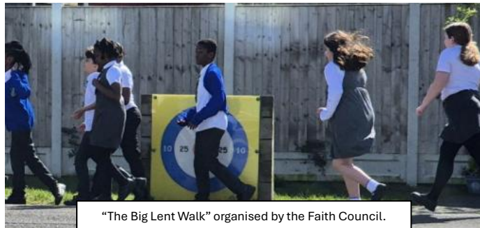
"The Big Lent Walk" organised by the Faith Council.