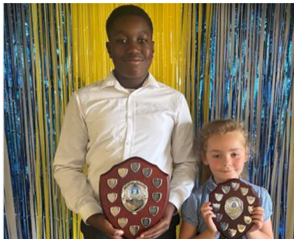
The prestigious Malaika Adam's "kindness award" celebrates when our children live "The Little Way" in their daily lives.