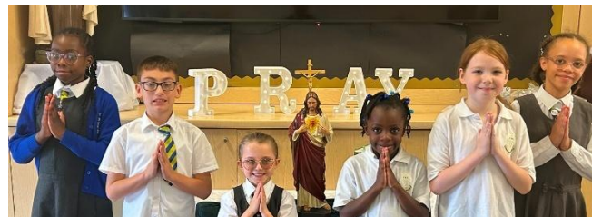
The Faith Council were instrumental in developing service and charity.