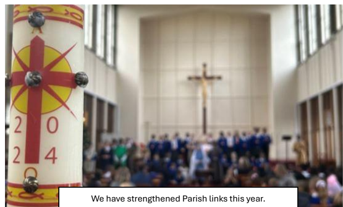
We have strengthened Parish links this year.