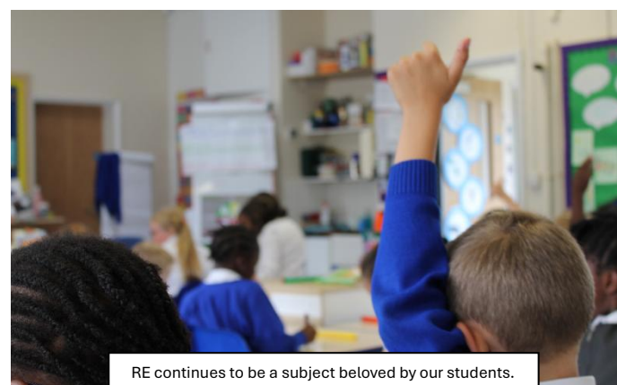
RE continues to be a subject beloved by our students.