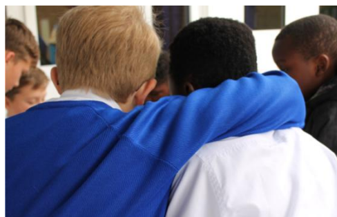
Parents recognised our sense of community and care.