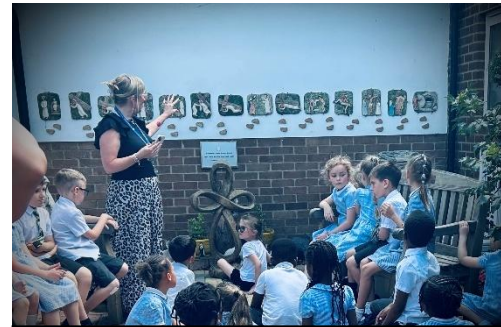
The Prayer Garden was fully restored by volunteers.