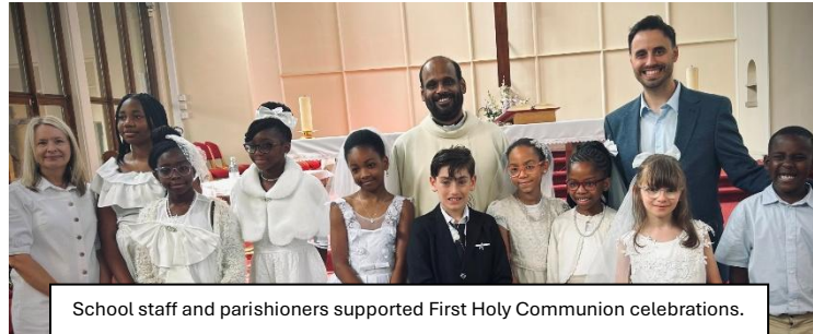
School staff and parishioners supported First Holy Communion celebrations.