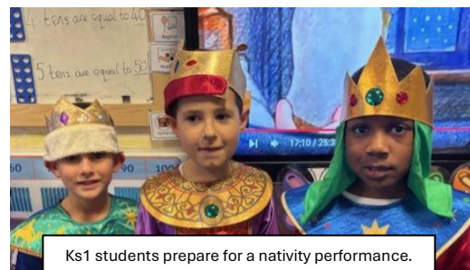
Ks1 students prepare for a nativity performance.