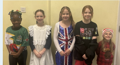
Citizens of the world! Children representing their cultures from across the globe!

The sight of our pupils donning free dress representing their family heritage was truly spectacular. From the intricate patterns of Indian saris to the bold colours of Nigerian attire, from the emerald greens of Irish garb to the elegant designs of Pakistani dress, and the stylish flair of Italian fashion – our school was a living, breathing celebration of global diversity.