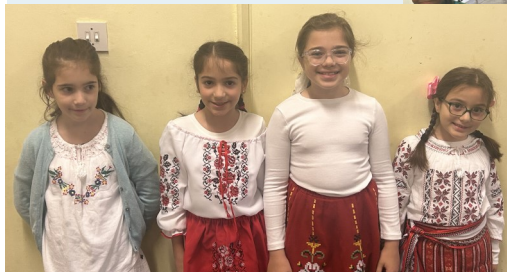
The girls wearing traditional dresses from Moldova and Romania.

Thank you to everyone who participated and made this day truly special.