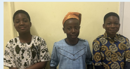
The boys look dapper, modelling traditional African outfits.

Days like these remind us of the beautiful diversity within our school community. It's not just about the colourful clothes or the tasty food – it's about understanding, respecting, and celebrating our differences. These experiences enrich our lives and help us grow as individuals and as a school.