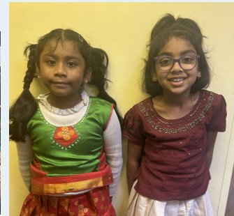
Traditional Indian clothing in Year 3.