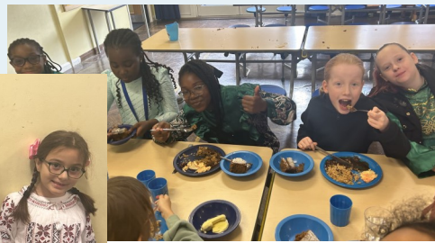
Children enjoying the "Black History Month" menu